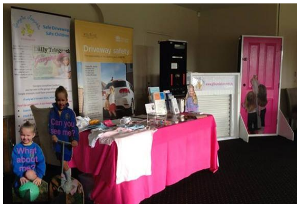
Display at MBA Tradeshow, Roseville, Sydney 31 st July.

The Foundation attended information nights on the 19 th and 20 th of August, presenting key messages about driveway safety, safe housing and driveway design to the builders who attended. Surveys conducted after each session showed before the presentation, 74% of attendees were unaware of the severity and frequency of LSVR accidents, and afterwards, 84% said they would discuss our ideas with their clients.